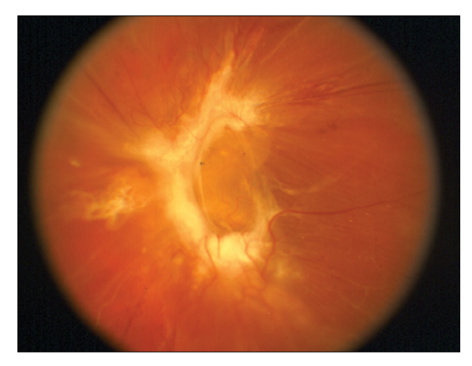
Traction retinal detachment

Vitreous hemorrhage alone does not cause permanent vision loss. When the blood clears, vision may return to its former level unless the macula is damaged.