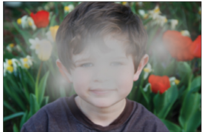
Blurring or dimming of vision