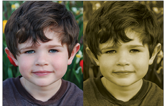
Left, normal vision. At right, dulled or yellowed vision.