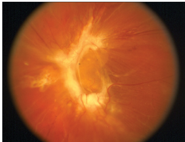
Traction retinal detachment

Vitreous hemorrhage alone does not cause permanent vision loss. When the blood clears, vision may return to its former level unless the macula is damaged.